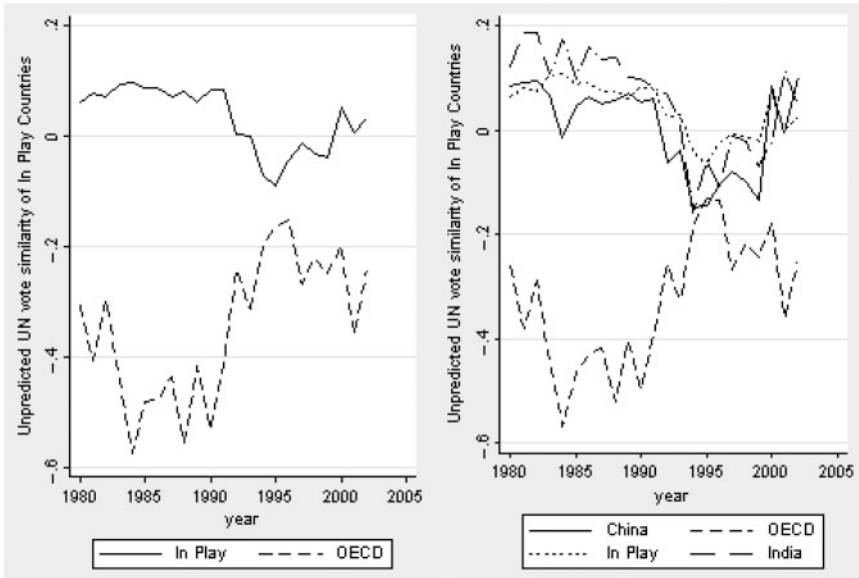
Fig. 2 UN Voting Patterns of In-Play Countries, 1980–2003.

Note: The lines represent the residuals, normalized by the absolute value of the affinity index of UN voting similarity, from a gravity model of the affinity index.